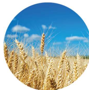
Quality Food & Agriculture Products