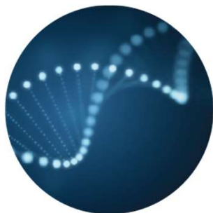
Life Sciences and Pharmaceuticals industry