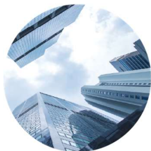
Global Business Services