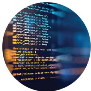
Information and Communication Technology