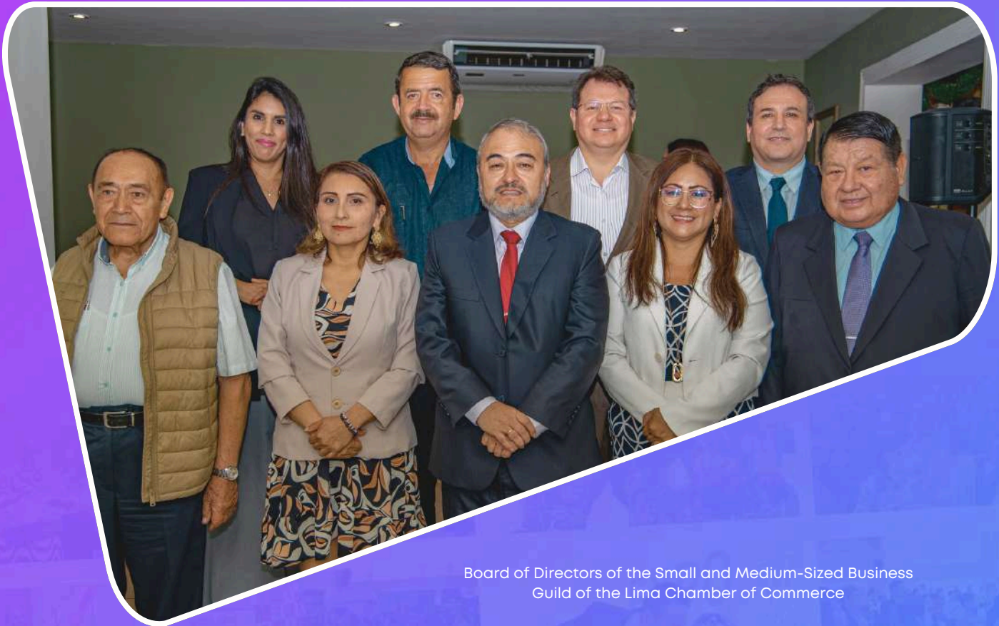
Board of Directors of the Small and Medium-Sized Business Guild of the Lima Chamber of Commerce